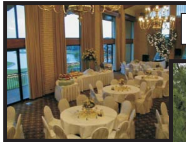
Las Colinas Country Club Dining Room

Many University Hills homes border the Las Colinas Country Club golf course. Also, the Four Seasons Resort & Club is only a short distance away.