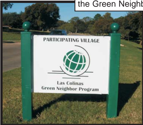
Homeowners participate in the Green Neighbor Program

University Hills, located in the heart of Las Colinas, has 450 lovely homes amidst trees and hills with nearby shopping, restaurants and schools. This neighborhood is the original jewel of the Las Colinas master planned community.