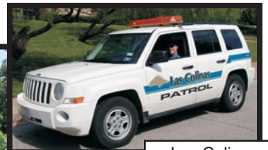
Las Colinas security patrol